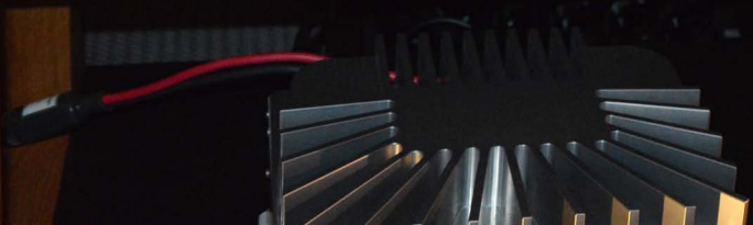
NAGRA Nagra MEL "Transient free" power with optional phono