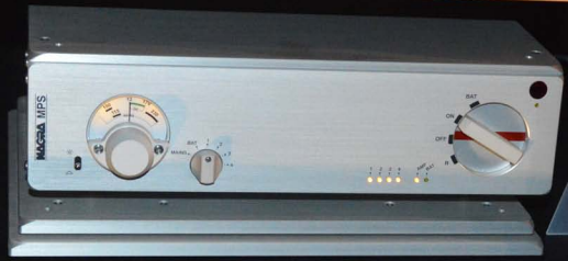
NAGRA Nagra MPS Multiple Power Supply